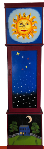
Two artistic collaborations: Lynn painted Reid's wood pieces.