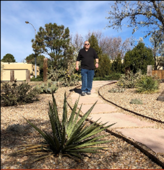
The cactus garden was one of Reid's projects on the PPCSA board.